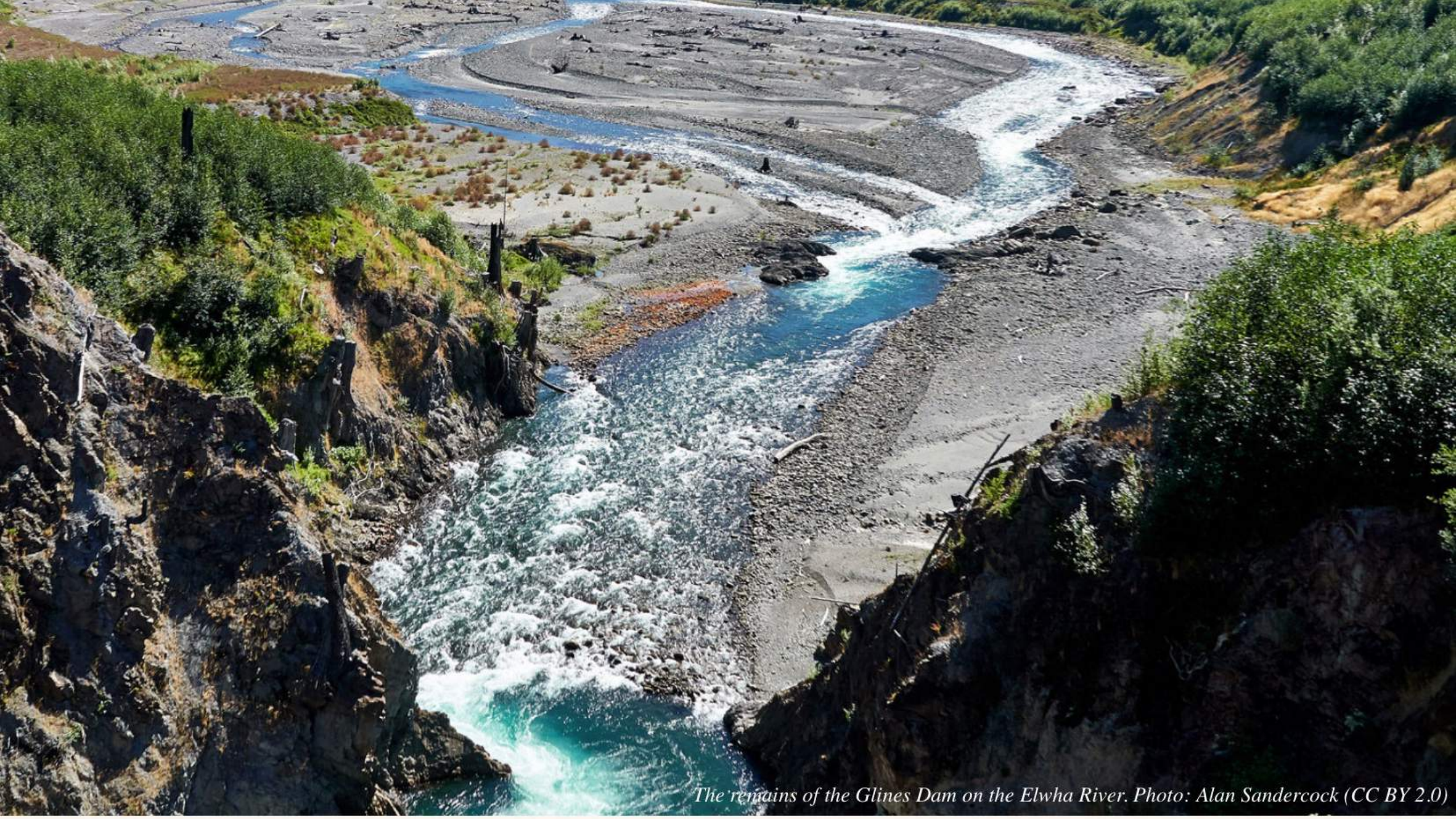
The remains of the Glines Dam on the Elwha River.