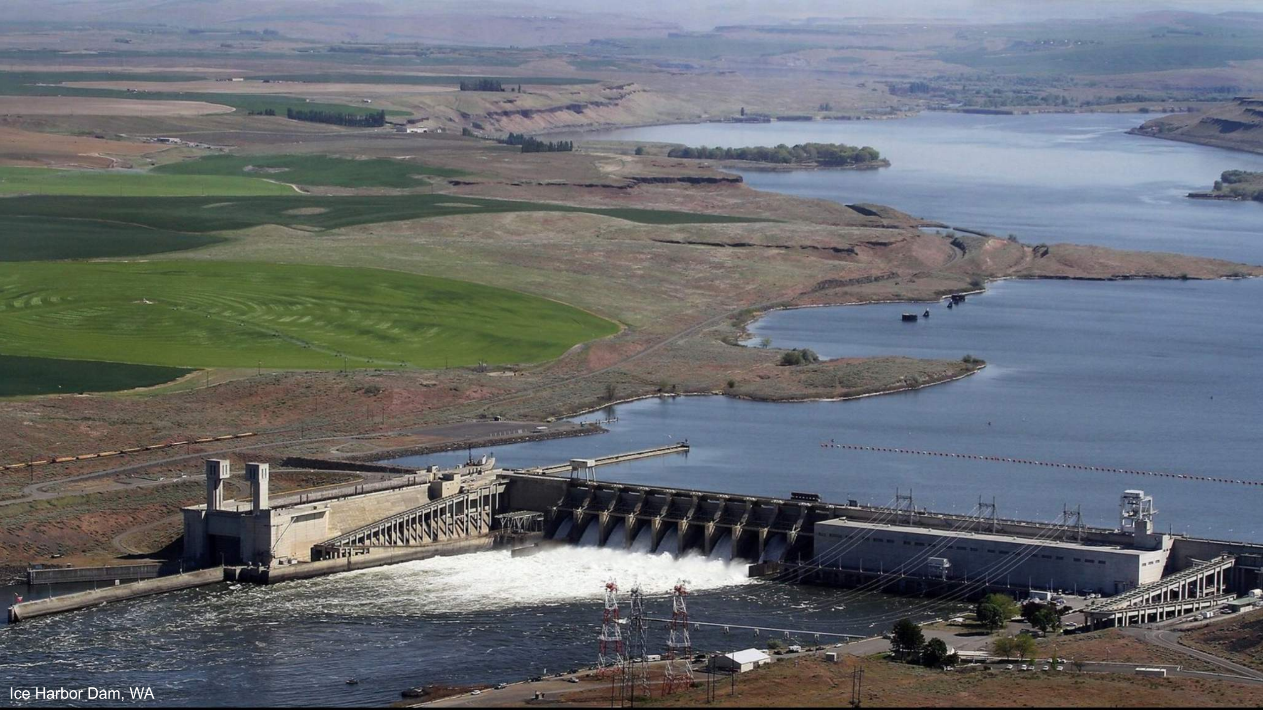
Ice Harbor Dam, WA