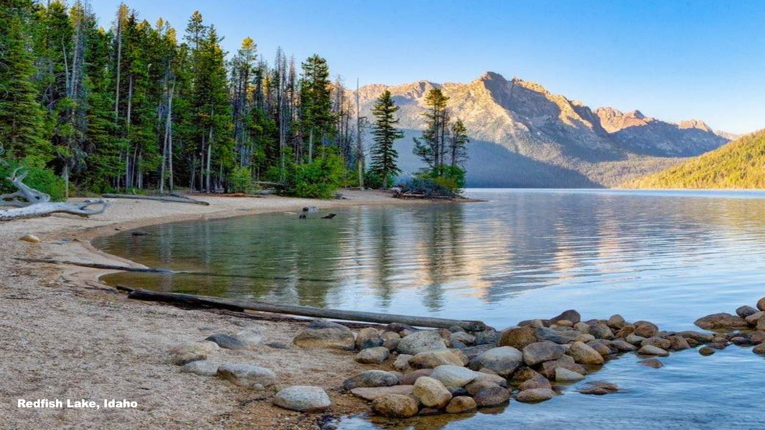
Redfish Lake, Idaho