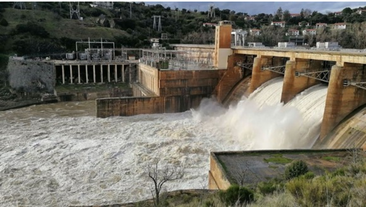
Villalcampo dam, Douro river