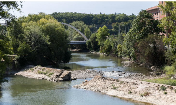
Santa Engracia dam, Arga river