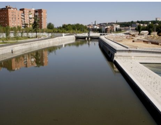
Manzanares river, Madrid.