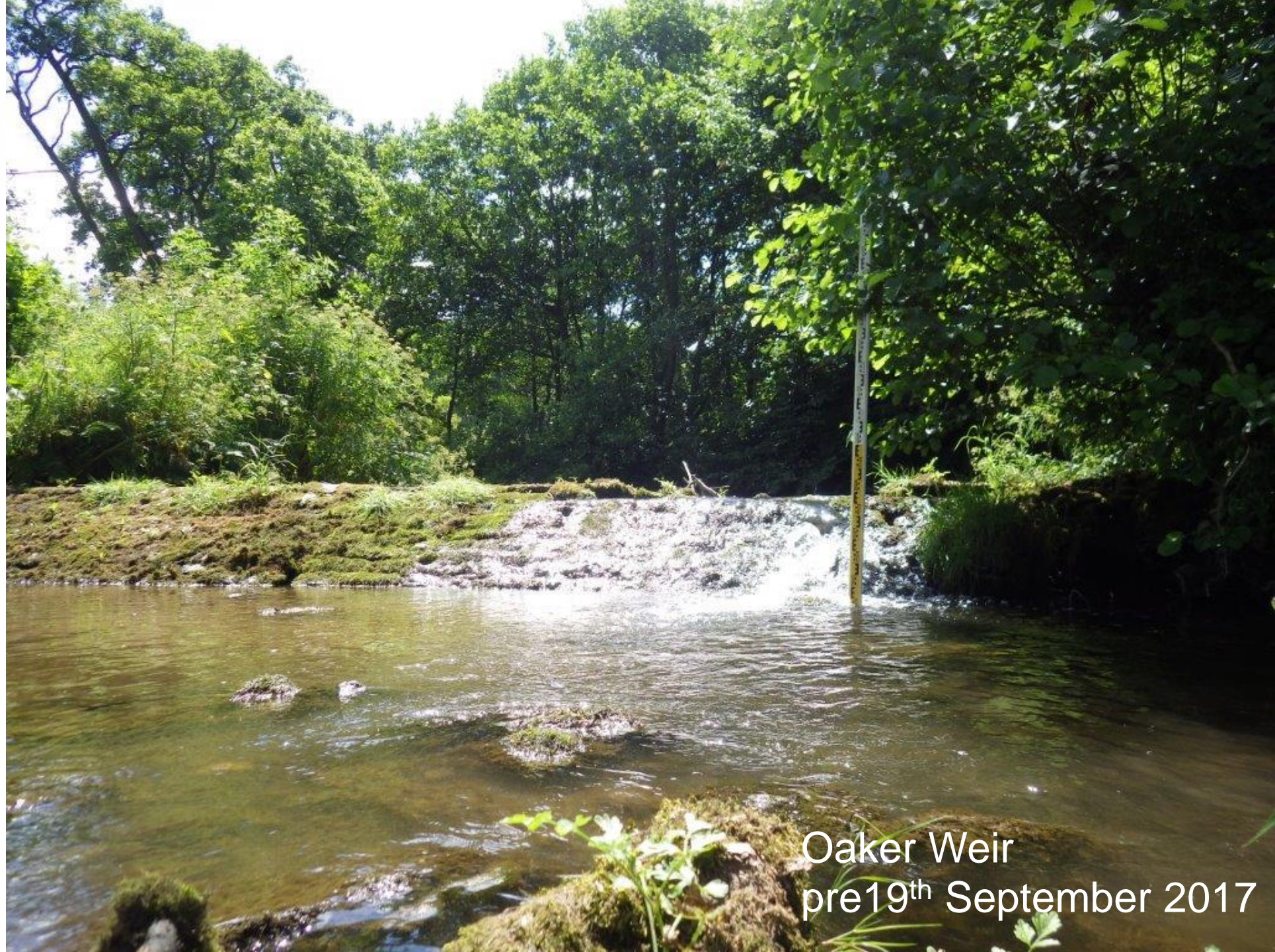
Oaker Weir pre 19 th September 2017